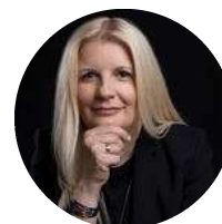
PROF. MINA GOUTI

European Research Council Established by the European Commission